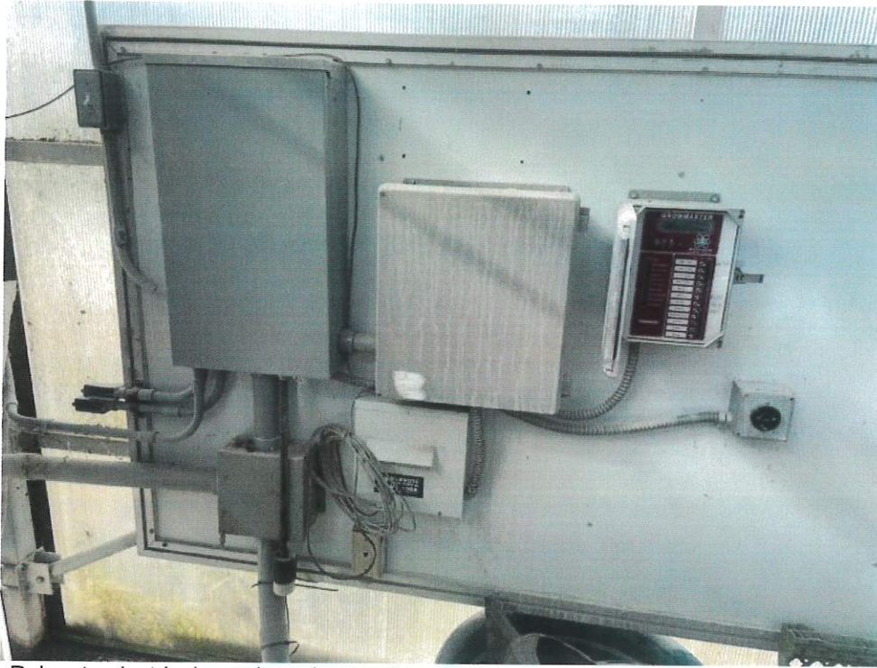
Relocate electrical panels and controllers to the next bay